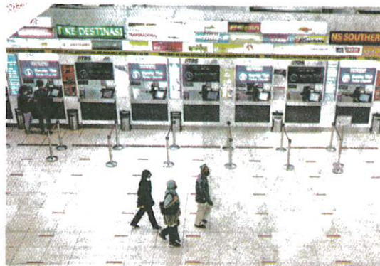
SUASANA di kaunter tiket bas Terminal Bersepadu Selatan di Bandar Tasik Selatan, Kuala Lumpur lengang berikutan larangan rentas negeri masih dikekalkan.

Katanya, melalui surveilan genomik terkini bagi tempoh yang sama, sebanyak 29 kes telah