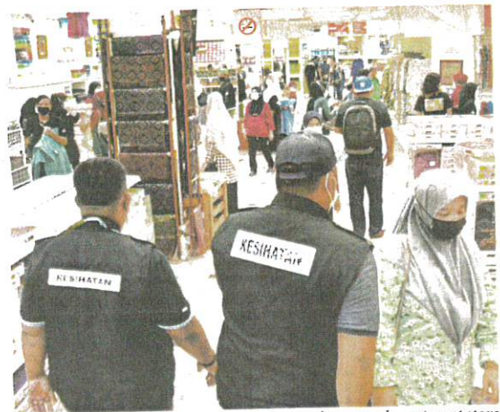
Health Department staff conducting inspections at a department store in Kuantan, Pahang to ensure public compliance with the Covid-19 standard operating procedures.

He said the deaths were recorded in Sarawak (five), Selangor