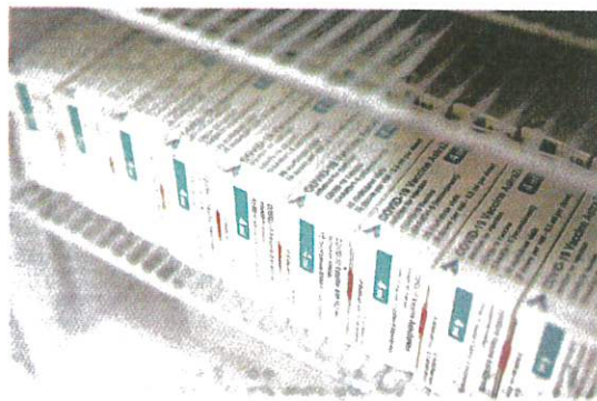
VAKSIN Covid-19 AstraZeneca selamat tiba di Malaysia kelmarin.

Beliau berkata demikian selepas menyerahkan peruntukan kepada badan bukan kerajaan (NGO) pada Majlis Penyampaian Peruntukan Parlimen Tenggara di Pusat Khidmat Wakil Rakyat Ahli Parlimen Tenggara, Taman Daiman, Kota Tinggi, semalam.