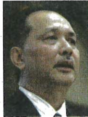
DR NOOR HISHAM

kan kes baharu tertinggi dengan 768 diikuti Sarawak (570), Kelantan (518), Kuala Lumpur (240), Pulau Pinang (134) dan Sabah (132).