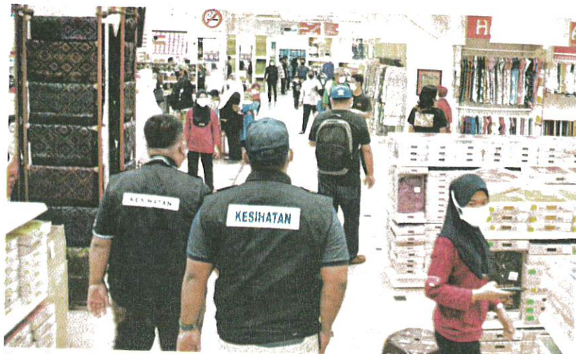
Penguatkuasa Pejabat Kesihatan Daerah Kuantan memantau pematuhan orang ramai di sebuah pusat beli-belah di Kuantan, semalam.

Sementara itu, Menteri Kesihatan, Datuk Seri Dr Adham Baba, berkata sebanyak 495,750 in-