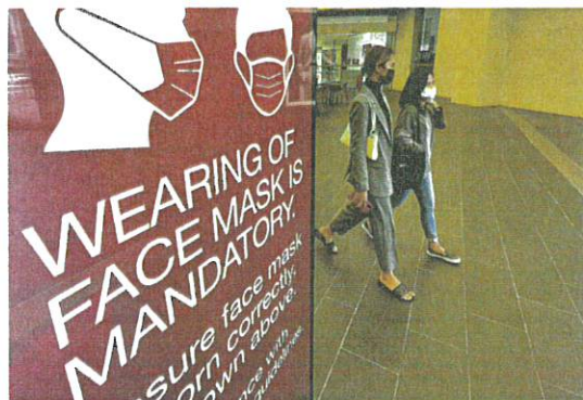
Gentle reminder: Wearing of facemask is mandatory, says an electronic board targeting visitors at The Pavilion, Kuala Lumpur.

policy should be imposed at workplaces in red zones and with tasks that could be done remotely.