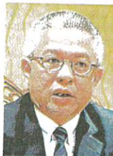
Dr Adham Baba

Ditanya kebimbangan masyarakat terhadap vaksin berkenaan, Dr Adham yang juga Ahli Parlimen Tenggara, berkata Jawatankuasa Khas Jaminan Akses Bekalan Vaksin COVID-19 (JKJAV) membuat ke-